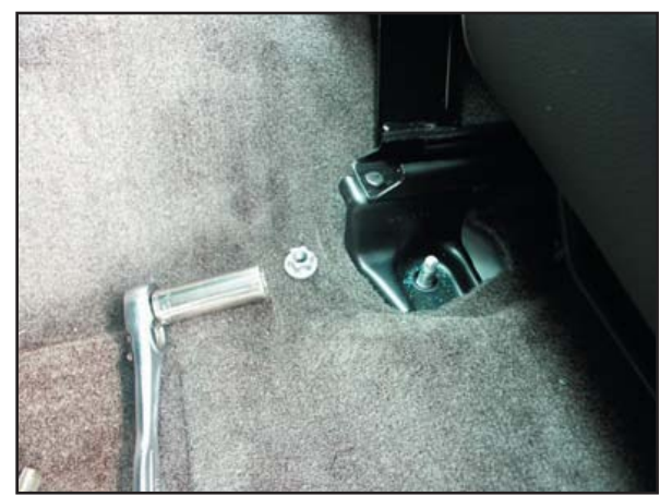
Remove OEM trim panel covering front inner seat bolts on driver and passenger sides. Remove seat bolt nuts. 15 mm socket required.